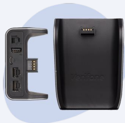
Bluetooth Charging Base