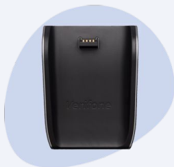
Standard Charging Base